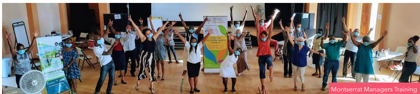
Montserrat Managers Training