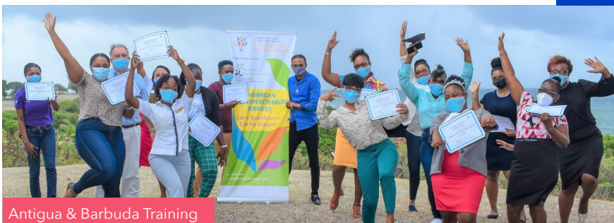
Antigua & Barbuda Training