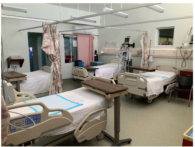
Intensive Care Unit (ICU) at the Joseph N France General Hospital in St. Kitts