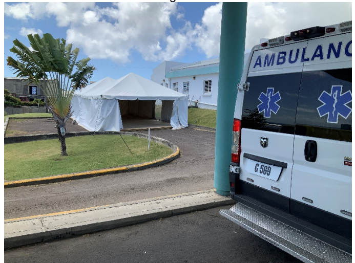
Ambulance designated for the COVID-19 response and the Tent Flu triage area outside of the Emergency Room of the Joseph N France General Hospital